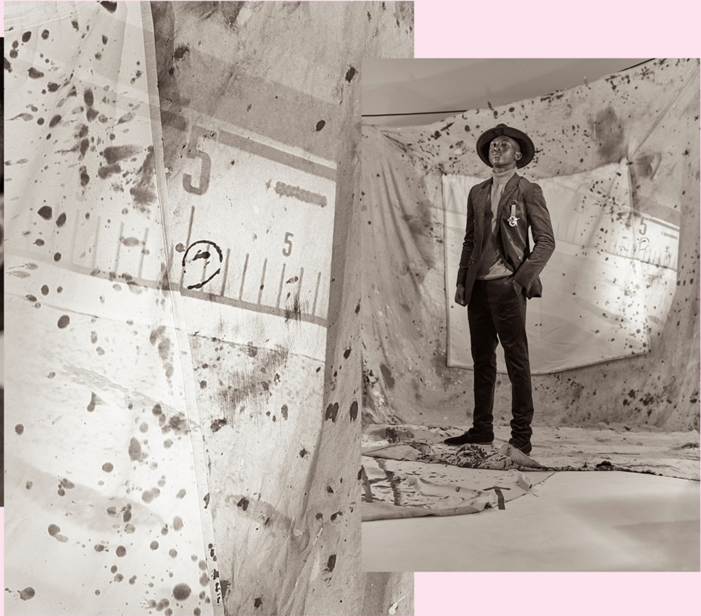
Black Fadora hat. Toffee Marl Roll neck jumper. Burgundy Corduroy double breasted skinny fit suit www.topman.com