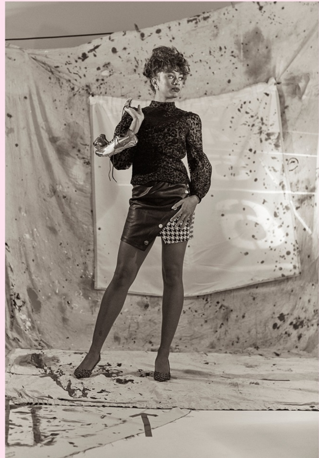
Zara Animal print organza blouse, www.zara.com River Island black houndstooth print wrap mini skirt, www.riverisland.com . Leopard shoes, www.hm.com